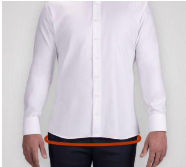
Illustration 9: Measuring Hip / Seat

For a hip or seat measurement, wrap the tape around the widest part of the hip and buttock. This is another circumferential measurement, which means you'll want to encircle the body with the tape.