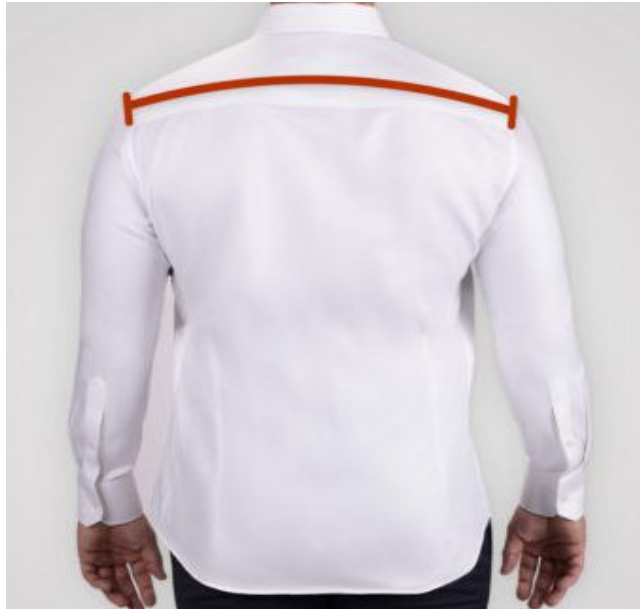
Illustration 2: Measuring Shoulder

person isn't too muscular, feel for the bone to make sure you've found the spot. Then stretch the tape across the back to the same point on the opposite shoulder, following the natural curve of the back.