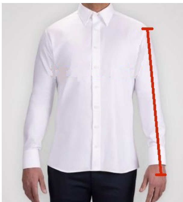
Illustration 3: Measuring Sleeve Length

For measuring sleeve length, start from the tip of the shoulder (the same spot you used for the shoulder measurement) and run the tape down outside of the arm to just before where thumb and forefinger meet. The person should keep the arms straight and relaxed.