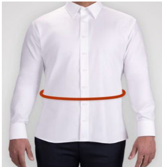
Illustration 5: Measuring Waist

As with the chest, measure the waist circumferentially with the tailor's tape around the widest part of the belly. This is usually around the belly button. The person should relax the body and maintain a natural stance with both arms straight down.