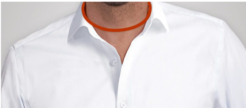
Illustration 1: Measuring Collar / Neck

To measure a collar/neck, place the tape just below the Adam's apple, where the neck joins the shoulder muscles and take the circumferential measurement around the neck. For a comfortable fit, place a finger between the tape and neck to ensure the tape isn't too snug.