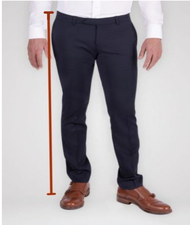
Illustration 10: Measuring Trouser Length