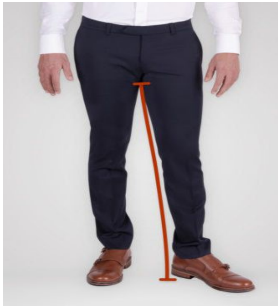
Illustration 11: Measuring In-seam

To measure in-seam, run the tape along the inner leg from just under the crotch down to the floor. The person should stand up straight with legs slightly opened for this measurement and avoid high-heel shoes.