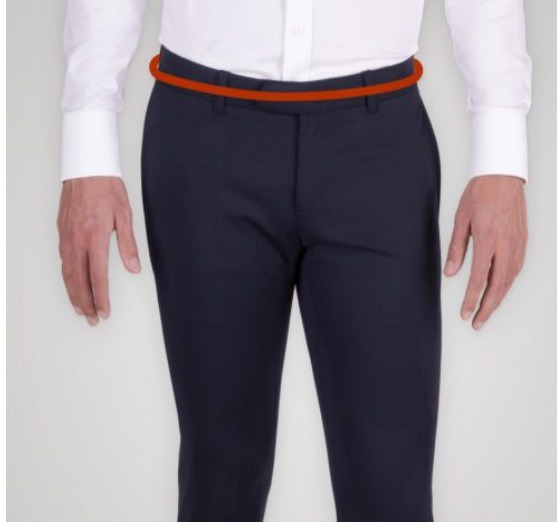
Illustration 8: Measuring Trouser Waist