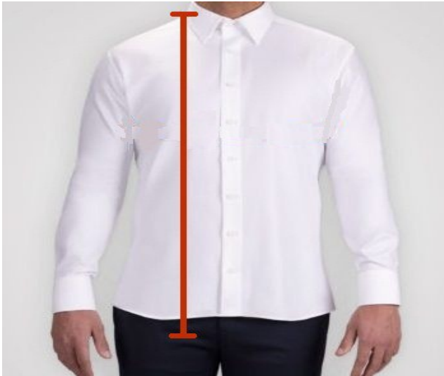
Illustration 6: Measuring Boy's Shirt Length

For measuring the length of a girl's shirt, run the tape straight down till the knees.