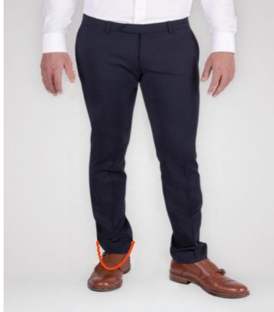
Illustration 12: Measuring Bottom

you can also measure circumferentially the bottom of the favourite trouser.