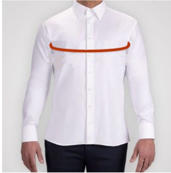
Illustration 4: Measuring Chest

To measure chest, wrap the tape beneath the armpits, fully encircling the body around the widest portion of chest. The person should relax and let the arms hang straight at sides. This is a circumferential measurement and is best taken from the front. For a comfortable fit, place a finger between the tape and chest to ensure the tape isn't too snug.